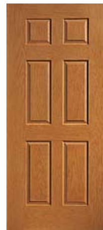
Door: FC60 Fiber-Classic®