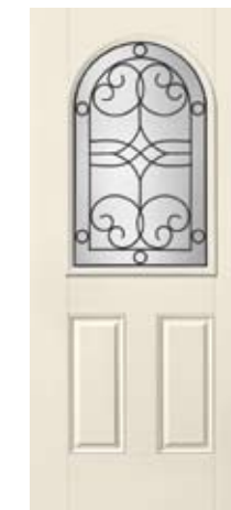
Door: S6011 Smooth-Star® Salinas™ Glass (Wrought Iron)