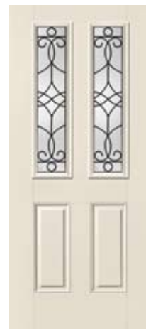
Door: S6014 Smooth-Star® Salinas™ Glass (Wrought Iron)