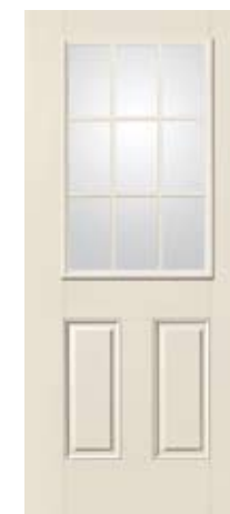
Door: S262 Smooth-Star® Clear Glass (Grilles)