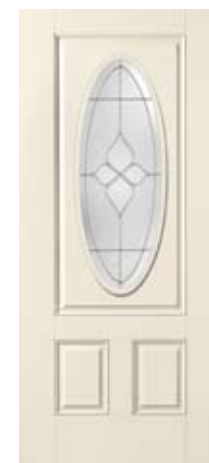
Door: S77 Smooth-Star® Concorde™ Glass (Brass, Brushed Nickel)