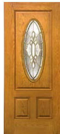
Door: FC84 Fiber-Classic® Keystone™ Glass (Brass, Brushed Nickel)