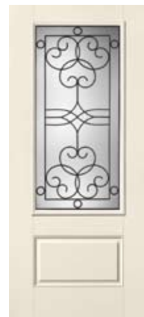
Door: S6010 Smooth-Star® Salinas™ Glass (Wrought Iron)