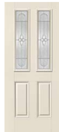
Door: S430 Smooth-Star® Concorde™ Glass (Brass, Brushed Nickel)