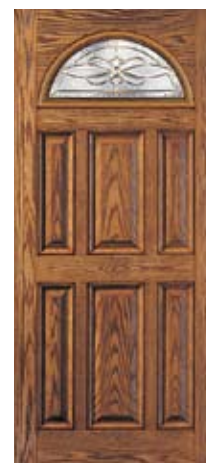
Door: CC26 Classic-Craft® Cambridge Glass (Brass, Brushed Nickel)