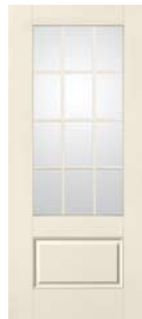
Door: S2250 Smooth-Star® Clear Glass (Grilles)