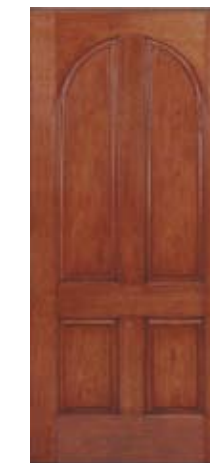
Door: CCR040 Classic-Craft® Rustic Collection™