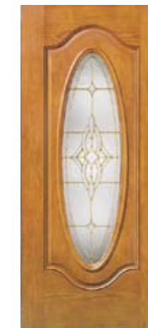
Door: FC121 Fiber-Classic® Wellesley™ Glass (Brass, Brushed Nickel)