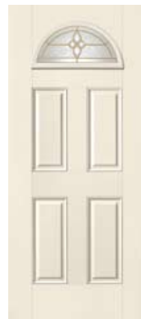
Door: S454 Smooth-Star® Concorde™ Glass (Brass, Brushed Nickel)