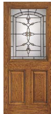
Door: CC110 Clasic-Craft® Bella™ Glass (Bronze - Black Nickel, Bronze - Brushed Nickel, Granite - Black Nickel, Granite - Brushed Nickel)