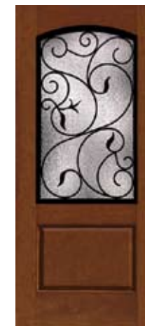
Door: CCR20037 Classic-Craft® Rustic Collection™ Augustine™ Glass (Wrought Iron)