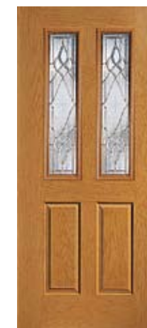
Door: FC47 Fiber-Classic® Starlite® Glass (Brass, Brushed Nickel)