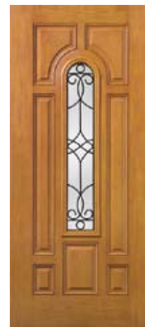
Door: FC118 Fiber-Classic® Salinas™ Glass (Wrought Iron)