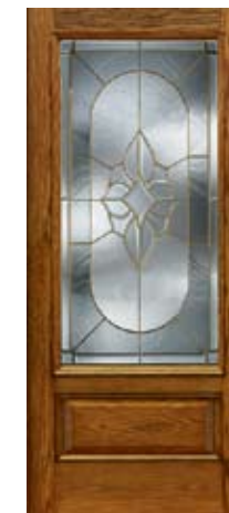
Door: CC99 Classic-Craft® Arcadia™ Glass (Brass, Brushed Nickel, Black Nickel)