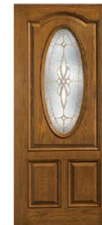
Door: CC76 Classic-Craft® Cambridge Glass (Brass, Brushed Nickel)