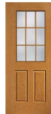
Door: 2150 Fiber-Classic® Clear Glass (Grilles)