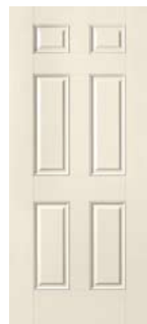
Door: S210 Smooth-Star®