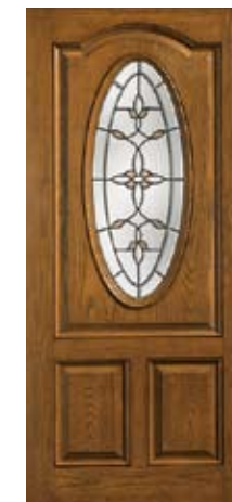
Door: CC113 Classic-Craft® Bella™ Glass (Bronze - Black Nickel, Bronze - Brushed Nickel, Granite - Black Nickel, Granite - Brushed Nickel)