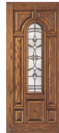
Door: CC112 Classic-Craft® Bella™ Glass (Bronze - Black Nickel, Bronze - Brushed Nickel, Granite - Black Nickel, Granite - Brushed Nickel)