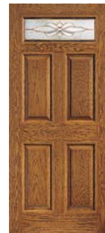
Door: CC86 Classic-Craft® Cambridge Glass (Brass, Brushed Nickel)