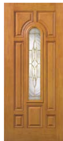
Door: FC125 Fiber-Classic® Wellesley™ Glass (Brass, Brushed Nickel)